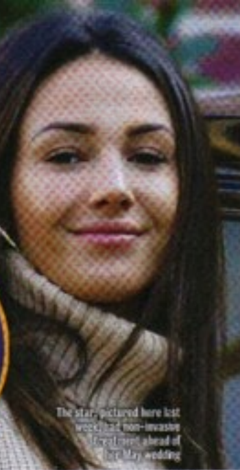
The star, pictured here last week, had non-invasive facials ahead of her July wedding