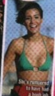
She's rumoured to have had a boob job